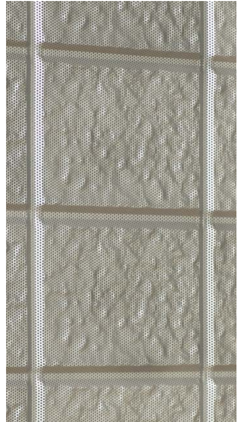
MTH Concertto Vivo is also available with perforation.

Colour selection: Wide selection of standard colours and materials, also special colours.