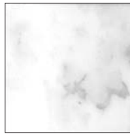
Marble texture Carrara white Aluminum 1.00 mm