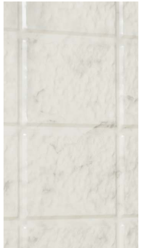
MTH Concertto Vivo product sheet made of PVDF coated aluminum with marble texture.